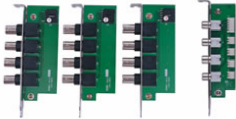
5-16 Cams BNC Video Extension Card & 4 ports Audio Extension Card