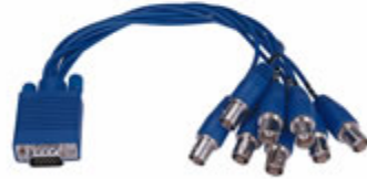
9-16 Cams Video Cable