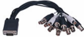
1-8 Cams Video/Audio Cable